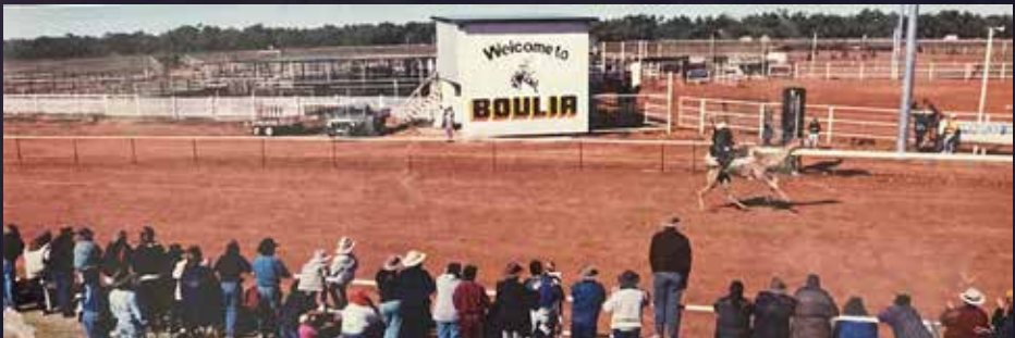
At the finish line of the first camel races in 1997

In Boulia we began the change from Australia's predominately tourism-oriented camel races to a full-blown professional affair. The distance of the races was lengthened, drug testing and microchipping of the camels was put in place and an act of parliament for the first time allowed legal bookmakers at camel races in Australia.