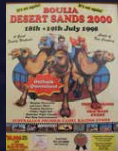
1998 - Australia's Premier Races