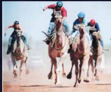
Jockeys didn't always wear silks