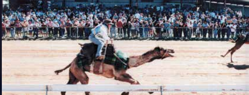
Down the home stretch